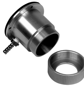
Duct Mount Assembly Stainless Steel – P/N 226846-008 Aluminum – P/N 226846-001 Designed for mounting combustible sensors to air handling duct work (flat surface mounting only).