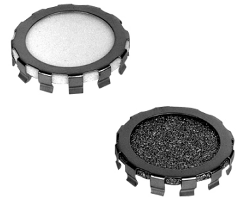
Dust Covers Stainless Steel – P/N 225312-001 Porex – P/N 226190-001 Recommended for protecting sensors in windy, dusty, and oily environments.