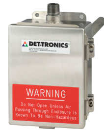
Q811 Duct Mount Enclosure SS/3/4" – P/N 000811-101 SS/M20 – P/N 000811-009 Provides combustible gas detection in air handling, heating, ventilation, and air conditioning ducts.