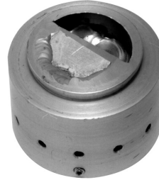
Splash Guard P/N 006491-001 Protect sensors from ingress due to rain or splashing water.