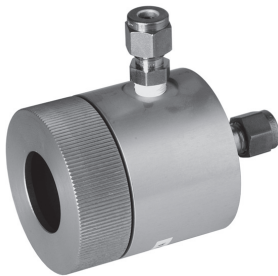
Sample Draw Cup Assembly P/N 009171-001 Provides a sealed enclosure with compression fittings to enable the sensor to be used as part of an extractive gas sampling system.