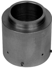
Rain Shield P/N 226349-001 Protect sensors from rain and snow.