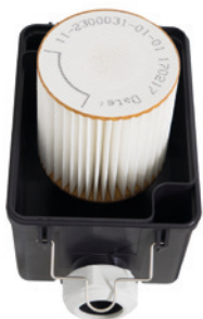
Standard DFU 911 dust filter unit

The new DFU 911S dust filter unit is equipped with a special protective flap. Additional monitoring is made as to whether a filter cartridge is inserted or not. If the filter cartridge is missing, an air flow fault is triggered on the ASD. This is a fast and effective way of determining whether the filter cartridge was deliberately removed or accidentally not inserted. While the filter cartridge is being replaced, the flap also prevents dirt from entering the sampling pipe.