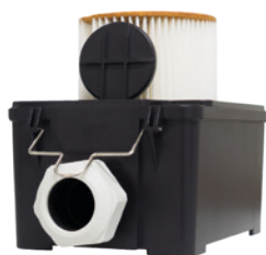
DFU 911S dust filter unit with integrated protective flap