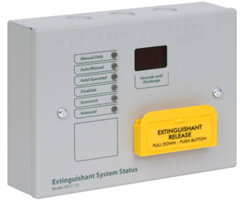
Model No. K911010M8