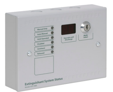
Model No. K911100M8