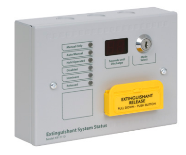
Model No. K911110M8